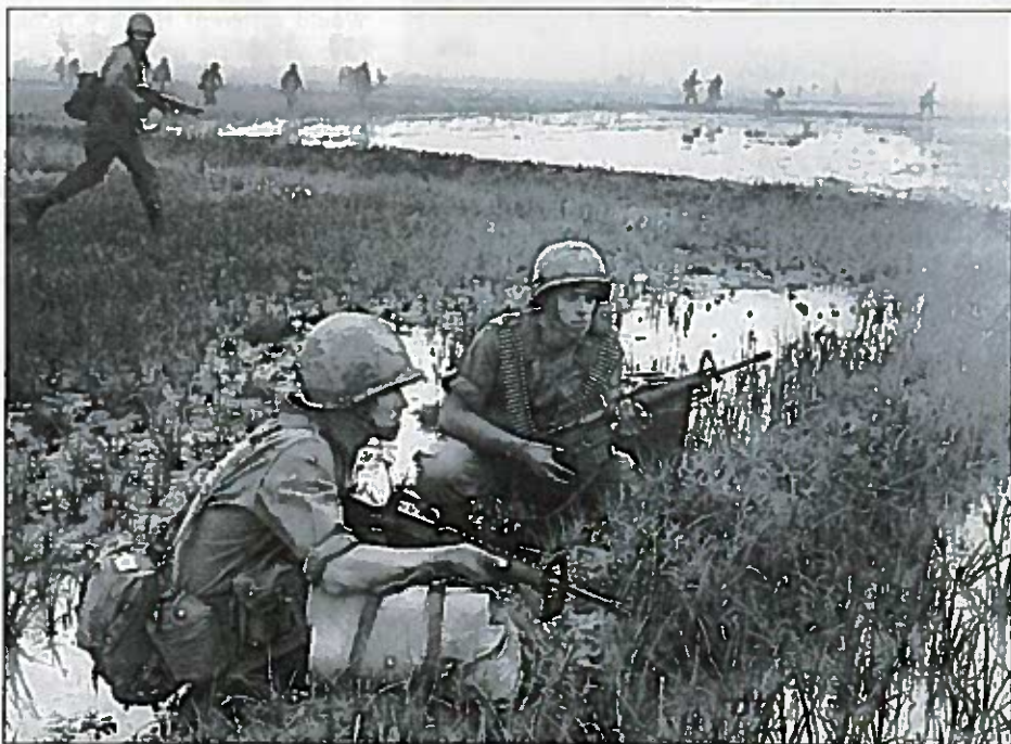
Two soldiers crouch in a rice paddy while fellow soldiers move across the paddy, April 1965.

Ellsberg offered one answer to that question. He rejected the "quagmire" thesis in favor of a "stalemate machine" explanation of U.S. policy. In this view, a deadlock was the best the U.S. could hope for in Vietnam because the war could not be won. Moreover, successive presidents preferred such a stalemate to the prospect of admitting defeat. Ellsberg identified domestic political concerns as an important source of this rather short-sighted and ignoble behavior, specifically the fear that haunted Democratic presidents of the accusation that they were "soft" on communism (6). Other commentators took a dif-