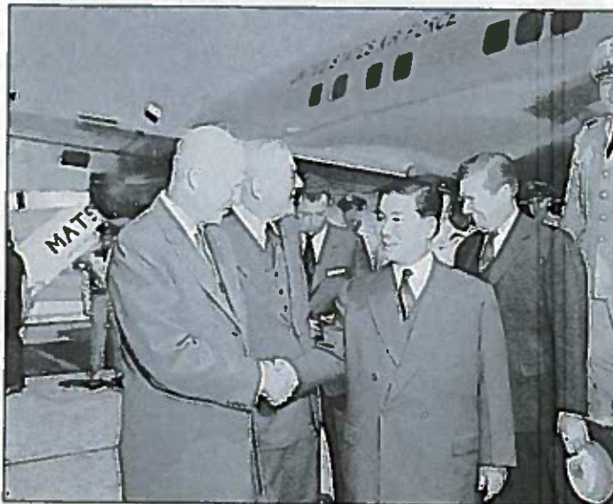
President Dwight D. Eisenhower and Secretary of State John Foster Dulles (from left) greet South Vietnam's President Ngo Dinh Diem at Washington National Airport, May 8, 1957.

While scholars have adopted many variations in approach and interpretation, we might usefully divide them into two main camps. In the first camp are those who are critical of America's intervention and view Vietnam as a bad war. Given the circumstances of the conflict, they also doubt whether the U.S. could ever have achieved its aim of